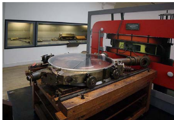
Cyclotron

Having grown up here in town I always felt like Livermore didn't receive the acknowledgment that it deserved. From now on I can proudly look towards any Periodic Table of Elements and know that Livermore has earned its place in history.