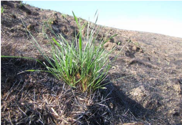
Purple Needle Grass

grasses put down deep roots and live for many, many years. As we would soon see, they benefit from fire, sending out new growth around the base. As winter and the rains came, we saw the leaves of mules ears, California purple aster and soaproot beginning to grow out of the burnt soil. Mysterious pairs of grass-like leaves sprouted in great profusion. It wasn't until April, when they sent up flower spikes, that it became clear these were Triteleia laxa , also known as wallybaskets or Ithuriel's spear. These gorgeous purple-blue flowers belong to the iris family and grow from a small bulb. I had been hiking this hillside for years but never saw one blooming on the west facing slope until after the burn. These native plants had been lurking there for years, putting out their